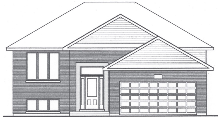
FRONT ELEVATION A

Note: House is Brick & Siding on Elevations Not Shown. Side of Garage is Full Brick